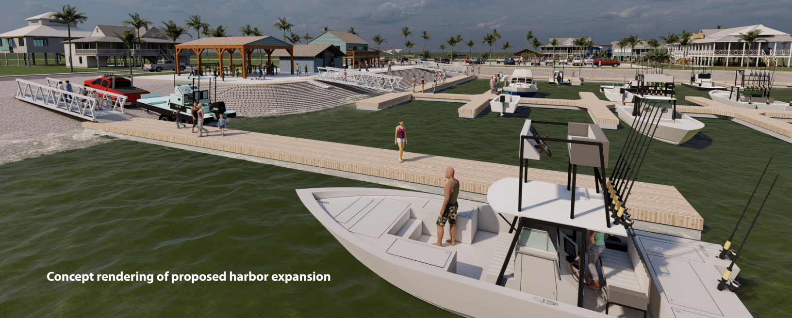
Concept rendering of proposed harbor expansion