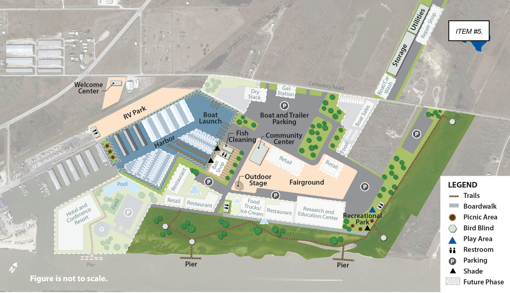
Figure is not to scale.