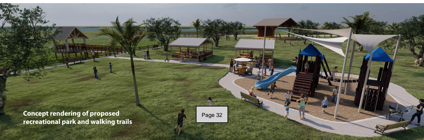
Concept rendering of proposed recreational park and walking trails